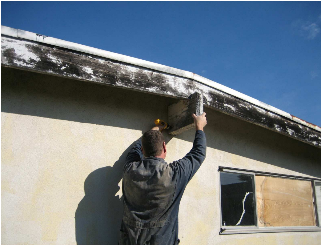
Figure 3. Example of drilling a board infested with drywood termites before Treatment; location Torrance, CA. Included in image is M. Red, Clark Pest Control.